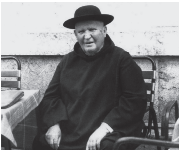
The Servant of God resting, waiting to meet his benefactors

May this testimony of such a true and credible life, nourish our journey as Hospitaller Brothers and inspire our co-workers to live the charism of hospitality with even greater fervour and passion in caring for the poor, the sick and the needy.