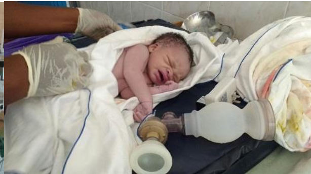
A baby delivered through Caesarian Section

Last year 15 th November, the X-ray department was recommissioned after it had ceased operation for some time. Physicians and patients alike have expressed relieve, hitherto patients had to go kilometres away from the hospital to get their x-ray taken.