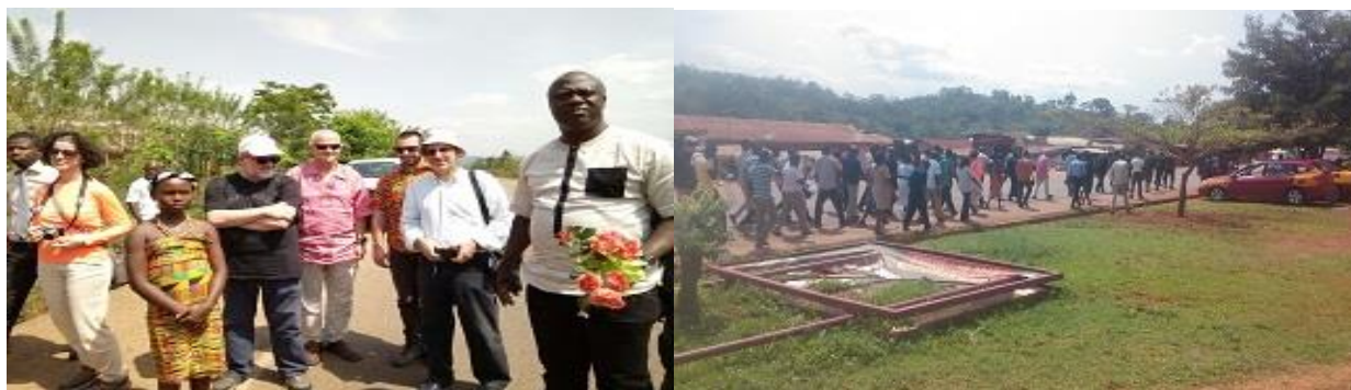
A flower girl presented a flower to provincial on arrival The entourage being welcomed with a brass band