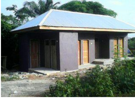
The new washroom at St. John of God Clinic, Oseikojokrom

Since its establishment the Clinic has had no appropriate washroom facilities. In October 2016, Management embarked on a washroom project at (from internally generated fund) the Clinic for both staff and patients. This project is considered a dying need of the Clinic and has also come to complement the status of the Clinic's upgrade to a Health Centre with a Physician Assistant. The facility consist of nine (9) individual rooms of washrooms, toilets and urinals for staff and patients and accordingly for both gents and ladies.