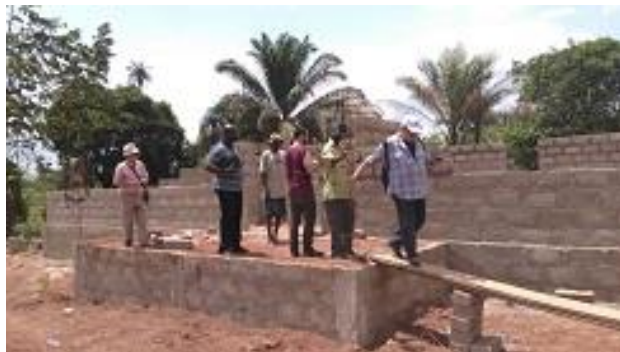
Inspection of the on-going Laboratory and Pharmacy Project at Oseikojokrom