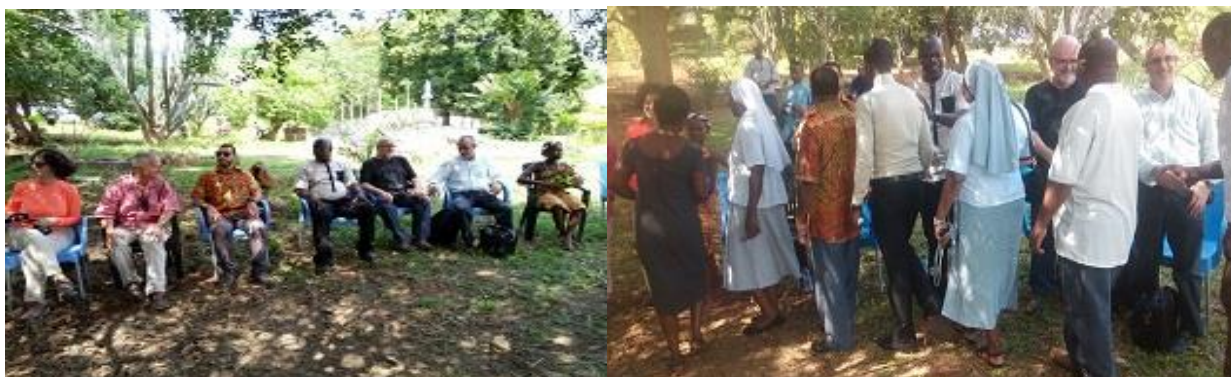
As tradition demands, the guests being asked of their mission. Staff welcoming the entourage with handshakes