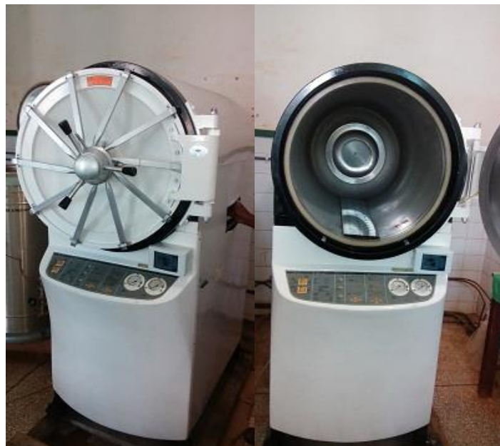
The new autoclave: Jactermac 300litres